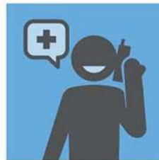
CALL BEFORE VISITING YOUR DOCTOR