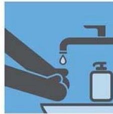
WASH HANDS OFTEN WITH WATER AND SOAP (20 SECONDS OR LONGER)